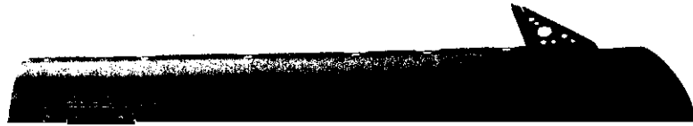
Photo 2 Door outer panel press-formed by organic composite coated sheet steel with extra-deep drawability and bake-hardenability

(3) 同じ素材を用い、同様の成形が可能な焼付塗膜面形成。さらに、成形後の冷却時に材料特性の劣化がきわめて小さい。